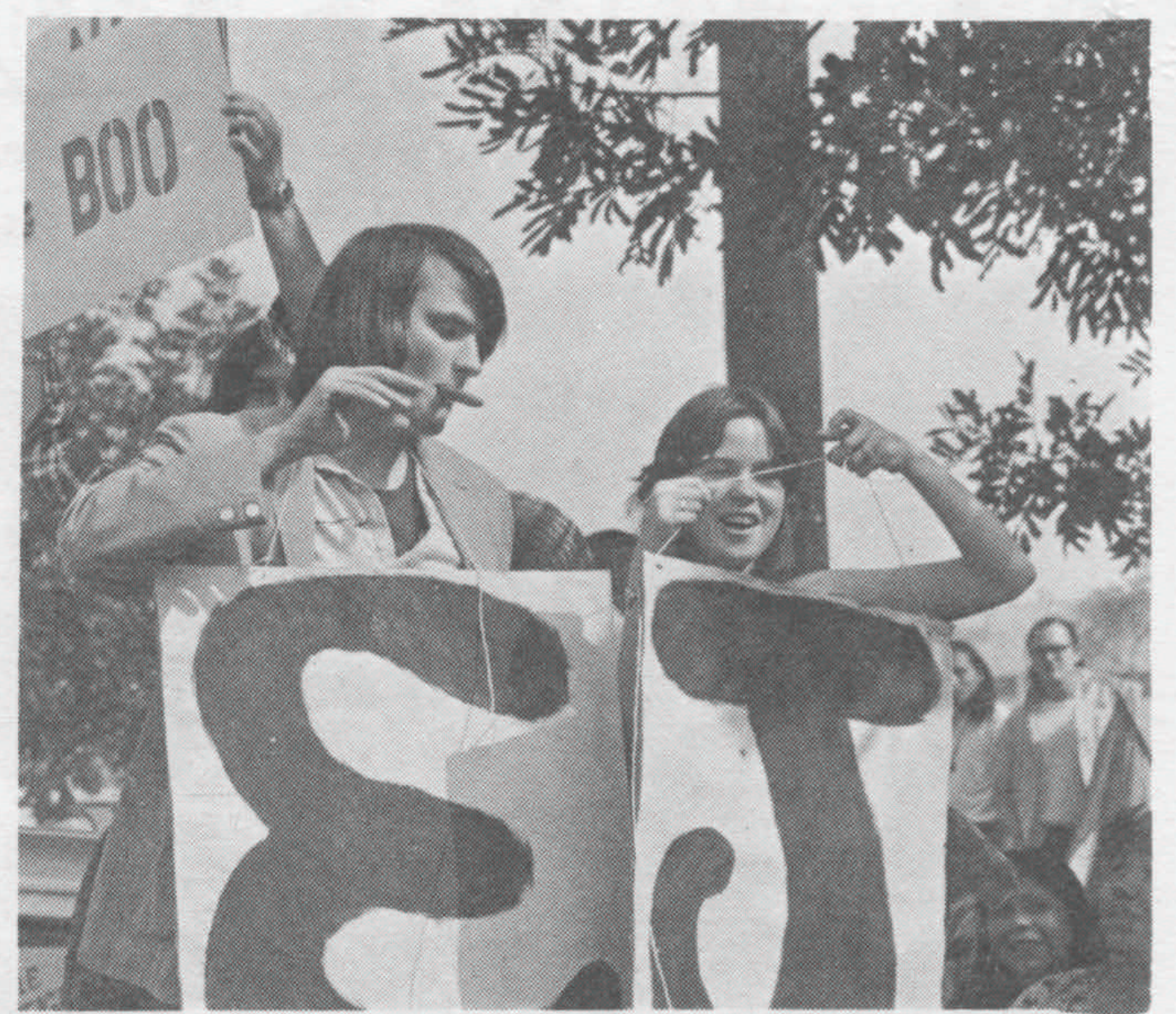
City of Commerce rally, featuring Gallo's history.